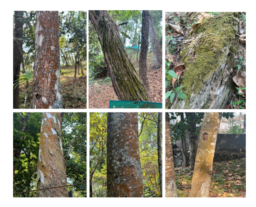
Figure 1: Bark of trees covered with biofilms of subaerial algae in Lady Keane College Campus